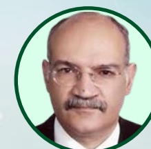
Gamal Hosny Egypt