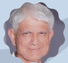
Keenan Joseph Alyn Hospital Israel