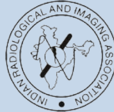
Indian Radiological and Imaging Association