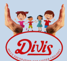
Divis Foundation For Gifted Children