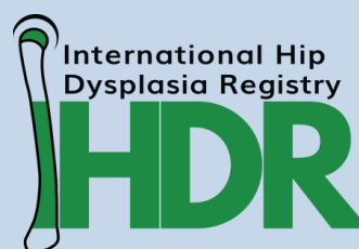
International Hip Dysplasia Registry