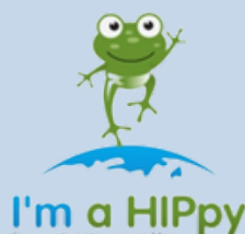
I'm A HIPpy Foundation